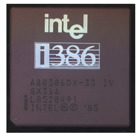
An Intel 80386 microprocessor

Furthermore, learning from the failures of the 286 protected mode to satisfy the needs for multiuser DOS, Intel added a separate virtual 8086 mode,<sup>[19]</sup>